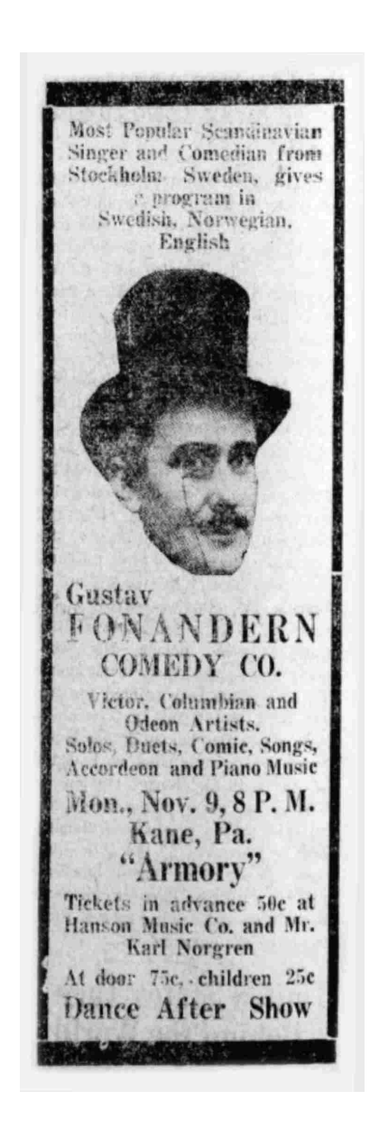
November 5, 1925 The Kane Republican, Kane, PA